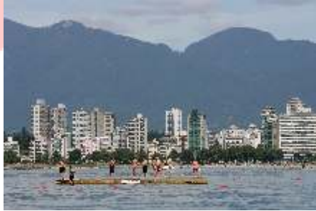
Spectacular Vancouver is the perfect place to visit, wrestle and just take a cool swim. (Kitsilano Beach)

Daily Schedule (Subject to change based on weather) Monday - Thursday 09:00-09:30 Warm Up 09:30 - 11:30 Technique and Drilling 11:30 - 12:30 Food 12:30 - 13:30 Sparring/Games 13:30 - 14:45 Reframing YMCA Day 14:45 - 16:00 Drills and live wrestling Friday - Dual Meet Tournament 09:00 - 4:00 Don't worry if you don't have a team. You'll be matched according to skill level. If you're here with a provincial or All-estate team you'll face rivals from other elite teams.